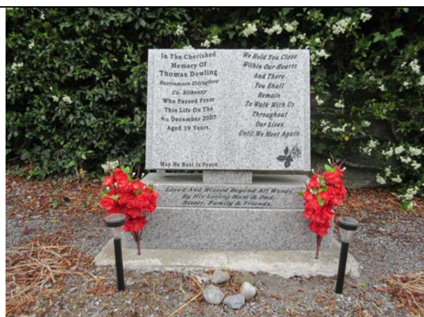
AMPS Ref 91541_01: Memorial at Troyswood in form of open book.