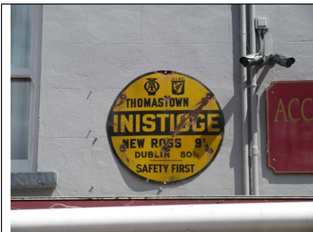
AMPS Ref 90908_04: Enamel roadside erected by AA and RIAC c.1920 at Inistioge.

Finally a rare circular cast metal 'fire insurance' plaque survives at No.8, The Parade (above Castle Cabinets Ltd) (AMPS Ref 90771_02). This plaque is thought to have been erected during the mid-19th century and is proof of insurance by the 'Sun Fire Office'. Fire plaques were erected on the facades of buildings during the 18th and 19th centuries by individual insurance companies to indicate that a particular property was insured. Each respective insurance company maintained its own fire bridge which extinguished fires in those buildings owned by policy holders (pre-dating the formation of municipal fire brigades). The Sun Fire Office, was founded in 1710, and was the first Insurance Company to use 'Fire Insurance Plaques' with early examples formed in cast lead having the number of the particular policy engraved or painted on a panel below. The plaque located at no.8, does not include a policy number and is likely to date to the 19th century. It may have originally been painted.