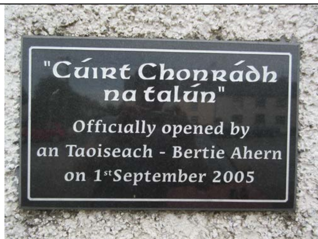
AMPS Ref 90898_03: Plaque commemorating the unveiling of a housing scheme by an Taoiseach, Bertie Ahern at Hugginstown in 2005.