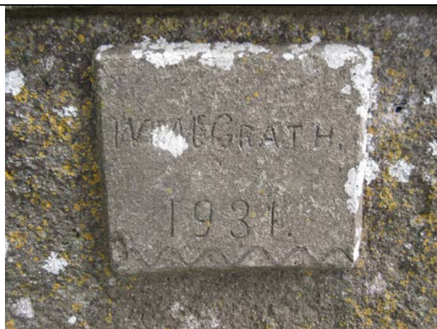
AMPS Ref 90764_01: Crudely inscribed concrete plaque to bridge at Freshford.