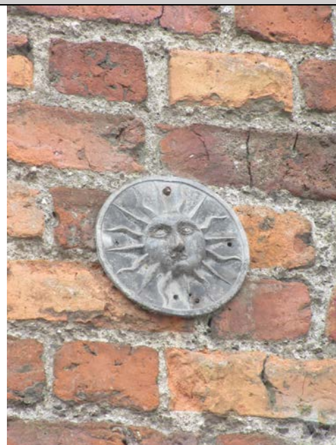
AMPS Ref 90771_02: Fire plaque to No.8, The Parade, Kilkenny city.