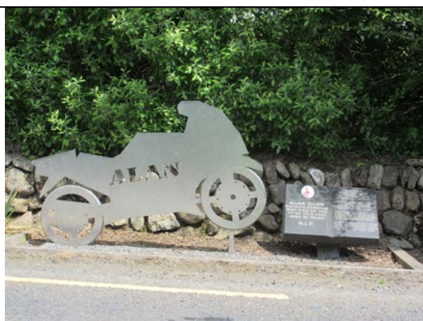
AMPS Ref 90056_01: Memorial between The Rower and Inistioge comprising two dimensional sheet metal motorbike and limestone marker.