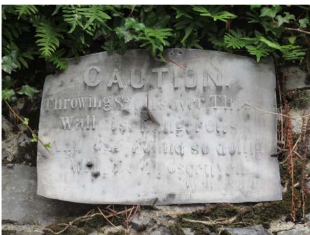
AMPS Ref 90692_06: Sheet metal sign at Castle wall c.1980 prohibiting the throwing of the stones.