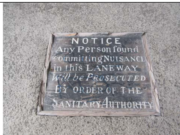
AMPS Ref 90772_02: Late 19th century timber Sanitary Authority sign at Market Slip, Kilkenny city.