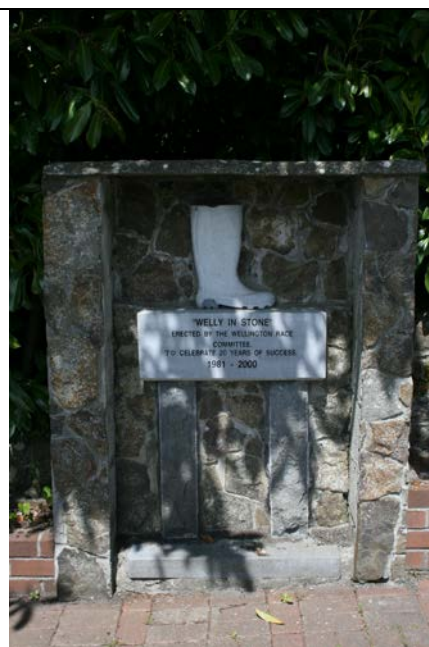
AMPS Ref 90442_01: Painted stone Wellington Boot and plaque commemorating the Wellington Race at Castlecomer.