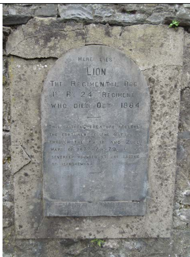
Detail of memorial to 'Lion' the regimental dog, Stephens Barracks, Kilkenny City.