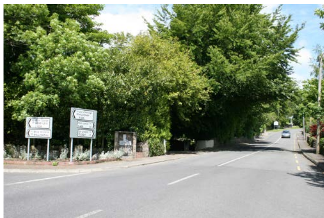
AMPS Ref 90442_02: Monument commemorating the Wellington Race at Castlecomer at junction of R426 and road leading to Ballinakill.

Community & Social Initiatives often offer opportunities to honour and celebrate significant community events or important social contributions made by individuals/groups. Tree planting schemes, the erection of dedication plaques and the creation of memorial gardens are common throughout the study area. One of the county's more unique community events, the Wellington Race at Castlecomer, has been fittingly marked with the erection of a painted stone Wellington Boot and a plaque to the north of the town on the junction of the R426 and Ballinakill Road (AMPS Ref 90442_02).