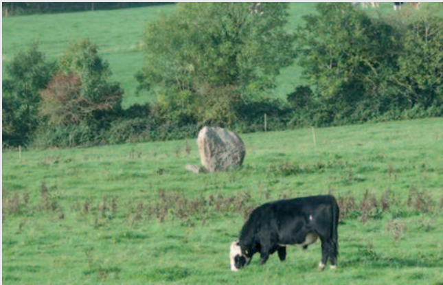
Standing stone in pasture close to Leac an Scáil portal tomb, Kilmogue townland. (J. Eogan)

The Councils of the City and County of Kilkenny