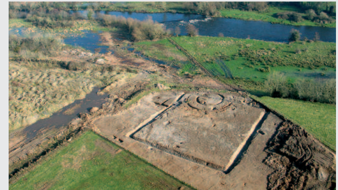
Bennettsbridge. Bronze Age ringditch with superimposed later medieval square enclosure.