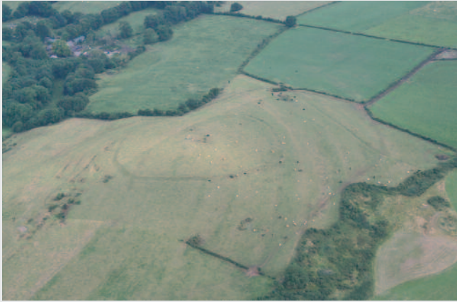
Freestone Hill. Late Bronze Age hillfort.