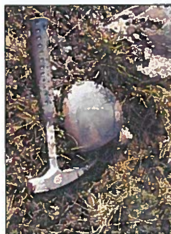
Left: Exposed mine shaft along part of the quarry face, probably from a bell pit, an early form of mining. Middle: Quarry face showing good sections of Upper Carboniferous shale of the Coolbaun Formation. Right: Iron rich nodule, found extensively in this shale formation, note its smooth edges and rounded appearance.