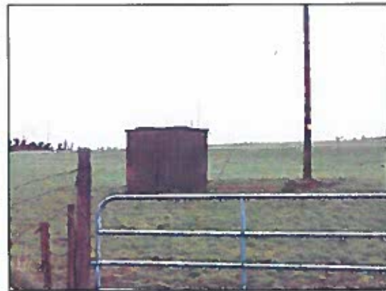
Left: Schematic drawing showing the dynamics of an artesian well. Right: Structure housing the artesian well.