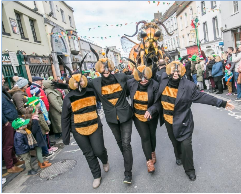
“Bring Back the Bees” was the theme of the Kilkenny St. Patricks Day Parade 2019