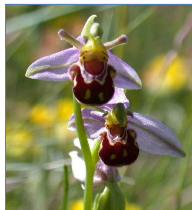
Wildflowers, including the bee orchid (right), at Dunmore Landfill