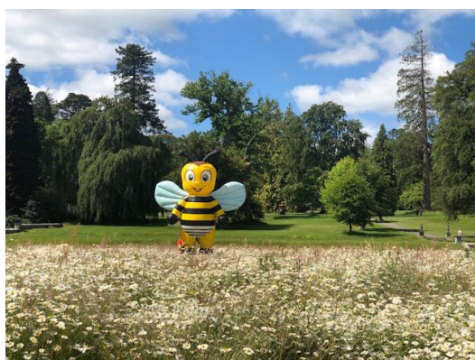
Fairytale Festival at Woodstock Gardens