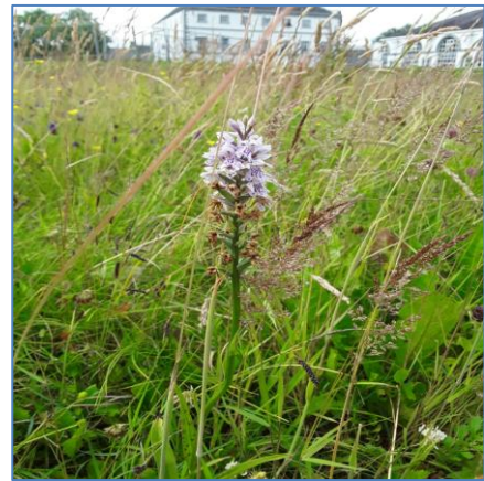
Common spotted orchid, County Hall Grounds. July 2019