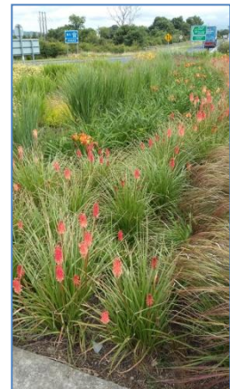
Link Road Roundabout, N10