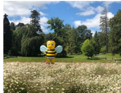
Fairytale Festival at Woodstock