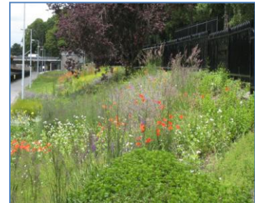
Peace Park, Kilkenny City