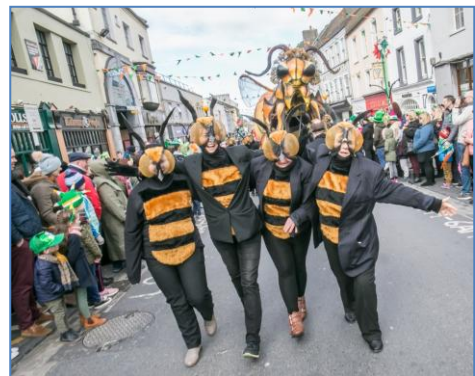
“Bring Back the Bees” was the theme of the Kilkenny St. Patricks Day Parade 2019