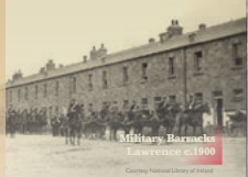
Military Barracks Lawrence 1900